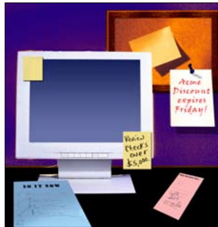
Business Alerts gives you a better way to track important events and be sure that you take advantage of business opportunities.

Use a similar Alert function to email a customer with the tracking number as an order is shipped. Include a link to the carrier's Web site to make it simple for your customer to track their order's shipping information. You're likely to reduce the number of calls to your customer service department.