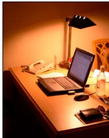
Sage TimeSheet offers a Web-based timesheet interface, this means that your employees can have easy access even when they are on the road.

It's not always convenient to approve expense reports along with an employee's timesheet. Many companies process timesheets weekly, or twice a month, while expense reports are processed on a