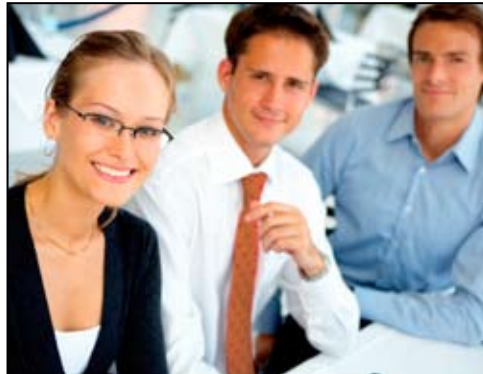
Give your customer service, sales, and collections staff quick access to the information they need with the new Business Insights Explorer functionality.

the quickest way to look up a customer account is by using their telephone number, that column can be moved to the left side of the grid so that it is easy to find. Clicking on the top of the column allows you to sort the grid by values in that column.