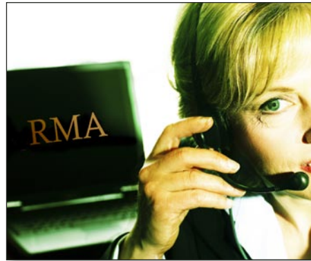
The RMA module's Inquiry program is a handy customer service tool for answering customer questions.

Are there some items for which you don't allow returns under any circumstances? No problem. An option for Returns Allowed in Inventory allows you to put some items out of consideration. When the occasional unannounced return arrives, your warehouse personnel can easily inspect, enter, and process the return through the system.